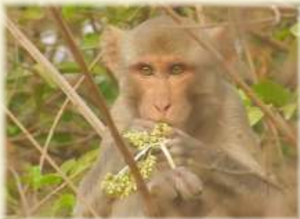
Crop Raiding Monkeys and Management Approaches