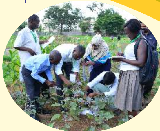
FTF ITT Training