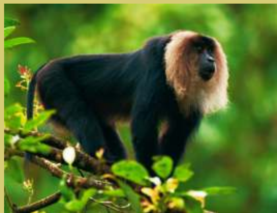
Lion tailed macaque